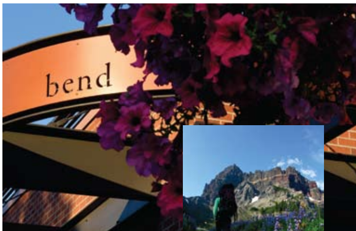
Purple petunias grace the Visit Bend office awning. | Hikers climb toward Three Fingered Jack Mountain in the Cascade Range west of Bend, Oregon.

If you still have time, take in a little of what drew folks here in the first place — the gorgeous outdoors. The Cascade Lakes Highway travels west out of town past snowy peaks including Mt. Bachelor , as well as several crystal-blue alpine