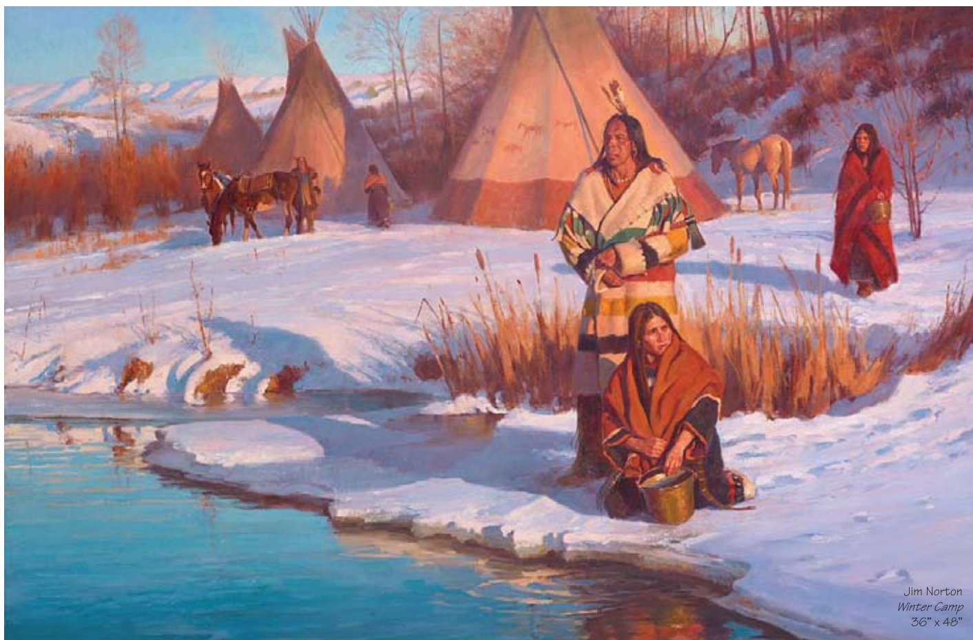
Jim Norton Winter Camp 36" x 48"

Sleepy mill town, no longer. A vacation to Central Oregon is a rich cultural experience surrounded by a stunning landscape. ■