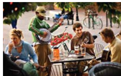
From top: The stylish, eco-chic boutique Oxford Hotel anchors downtown Bend. | A rainbow of beer tastes at Deschutes Brewery. | Bend's Cycle Pub tours the town. | Banjos and beers bring fun to Mirror Pond Plaza.