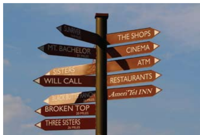
Opposite: Just one of many eclectic sculptures that make up Bend's Roundabout Art Route, Lodestar overlooks the Cascade Range from Reed Market Road. This page: Map illustration: Daphne Gillam | In Bend's Old Mill District, signs point the way to major attractions.

Fill up on Cajun Creole in a sleek atmosphere at Zydeco , or choose contemporary American at 900 Wall . You'll find urban organic fare at 10 Below , located in a boutique hotel, The Oxford . Thirsty? To leave downtown without sampling a microbrew would be sacrilege. Bend is home to eight microbreweries, with another handful located in surrounding cities, and even more in the works. The region's most famous was also Central Oregon's first — Deschutes Brewery , founded in 1990. Its flagship brewpub offers pub