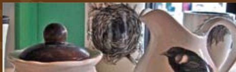
Opposite: © Zydeco This page: © The Feather's Edge Finery

Mockingbird Gallery 869 NW Wall Street | Suite 100 541.388.2107 | www.mockingbird-gallery.com